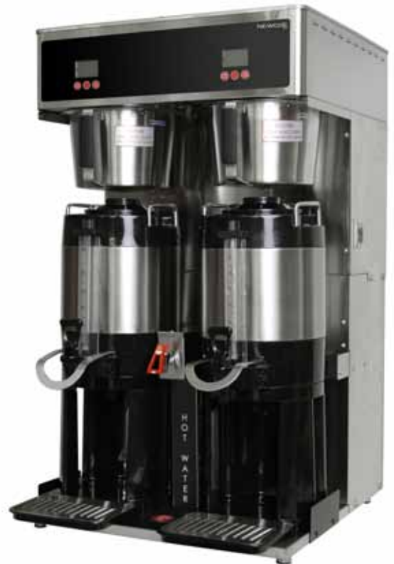
DTV COFFEE PN: 784535